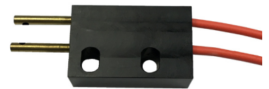
RAA-LT880 Transmissive Head